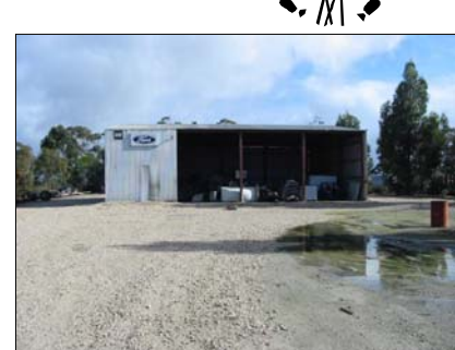
Original premises at 7th Street

Relocating has given the family business the scope to grow from what begun as a two-man show to become a national leader. This has also been made possible with the support from large transport companies such as Mackenzie Intermodal, McCarthy Transport, Martlew Bulk Haulage & Goodwin Freight Services who all started with a couple of trucks & now have fleets of up to 30.