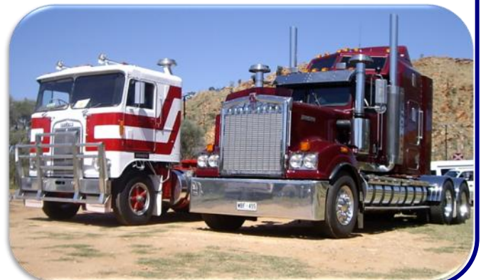
Right: The "new look" Bailey (K123) & T900, in Alice Springs.

Merry Christmas to All of our Customers. May your New Year be a safe & prosperous one. From all the Staff at Tatiara Truck & Trailers.