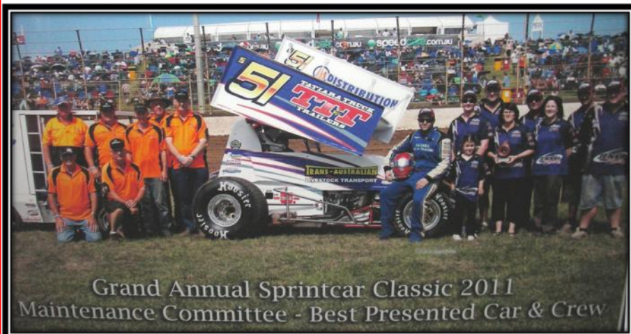
Jenkin Racing Team—Best Presented Car & Crew at Premier Speedway, Warrnambool.

Sunday, 26 December 2010 - SRA Eureka Sprintcar Series R6 / Gold Cup Heat: 7th. Heat: 2nd. B-Main: 2nd. A-Main: DNF (Power Steering).