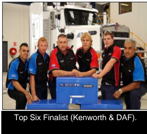
Top Six Finalist (Kenworth & DAF).