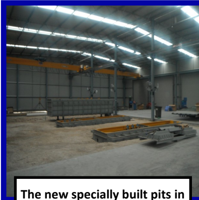
The new specially built pits in the workshop extension

There has also been significant progress with our specially built recovery trailer, which has been painted and is at a stage where it just needs to be reassembled. This will be operational in the new year.