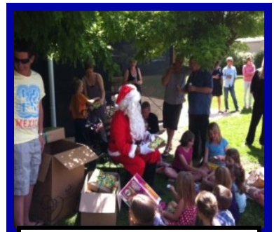
Santa giving out presents at the TTT Christmas family day

Pre-harvest was certainly very hectic. Along with servicing our regular clientele, this made the desperate need for more room in the workshop very evident. Staff have been working under enormous pressure to get customers back on the road with minimal downtime and have done so in an efficient manner. Last month, the workshop recorded the replacement of 14 clutches in just 12 days. This was in addition to our normal work, which is an