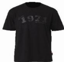
Kenworth Khaki Cap