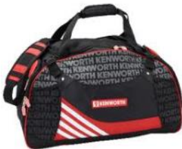
Kenworth Overnight Bag

Double zippered end pockets with bug zip pulls and screen printed word and bug logos