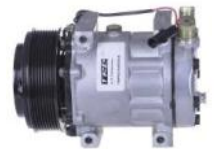
AC Compressor PV8 125mm $330 ea