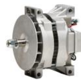
Alternator 175A Pad Mount $235 ea