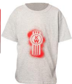
Kenworth Kids Bug Shirt