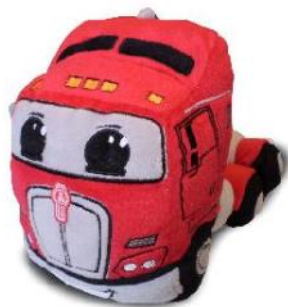
Kenworth Kids Plush Toy