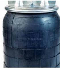
Selected Air Springs From $165.00