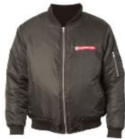
Kenworth Black Bomber Jacket $79.00