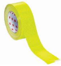
3M Vehicle Marking Tape From $99.00