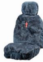
P/N: SK3050HSC $399.00 Pair