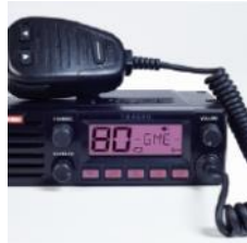
TX4500s GME Radio NOW $375.99