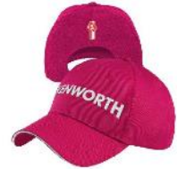
Ladies Pink Kenworth Hat $14.50