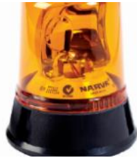
FROM $ 59.00