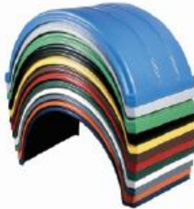
Spray Safe Plastic Mudguards NOW $44.75 ea