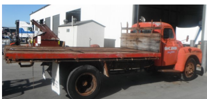
The AR-160 Before