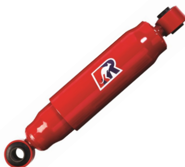
$143.00* HV521, HV511, HV503, HV508, HV514, HV526, HV530