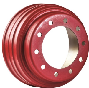
$ 200.00* 600004HD