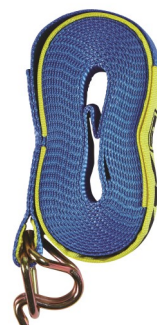
$13.50* 41659-16 11M H&K