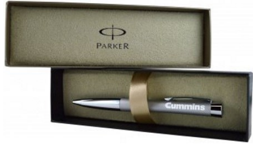
$ 47.50 GPI01521